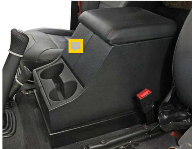
safe possible under front seat? if not, under console?