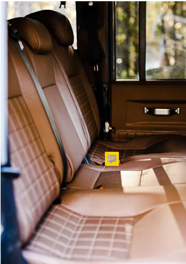
middle row seats with formed headrests, 2+ 1 (on driver's side)