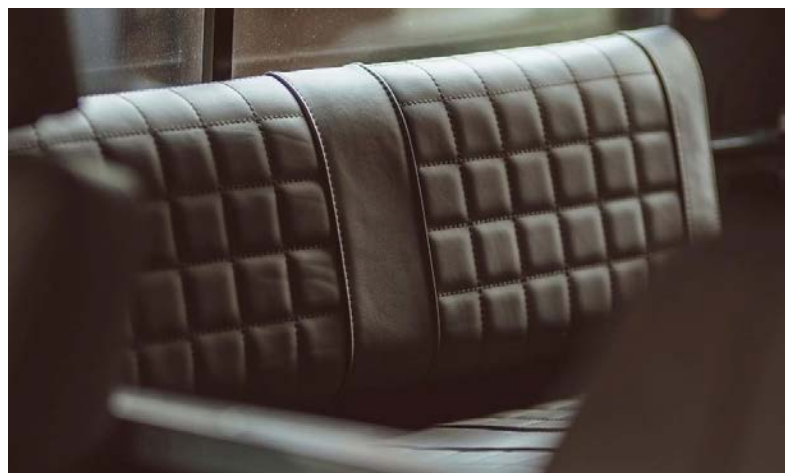
piping to indicate 2 seats within bench, wrap top