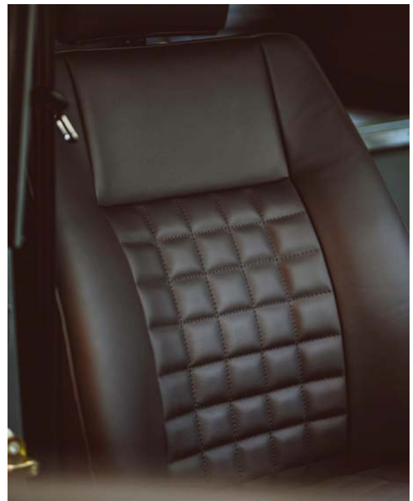
square stitch pattern 5 wide, 8 tall**