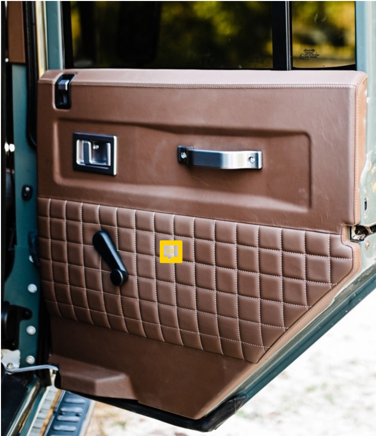
stainless steel door hardware simply safe security system install?