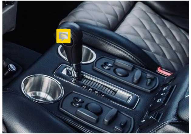
stainless steel cup holders large enough to fit 32 oz. hydro flasks