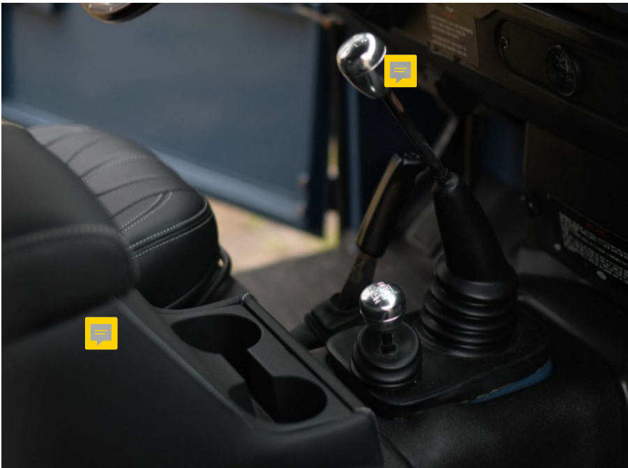
leather console to match no square stitching. piping around sides